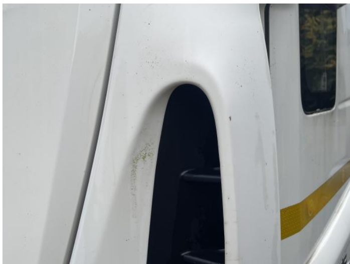
1: Wing nsf Chipped 1 To 5