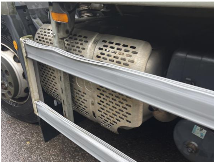
4: Qtr Panel Arch Extension ns Scuffed (Unpainted) Over 100mm