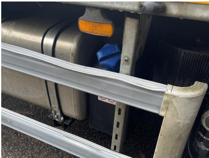
3: Qtr Panel Arch Extension os Scuffed (Unpainted) Over 100mm