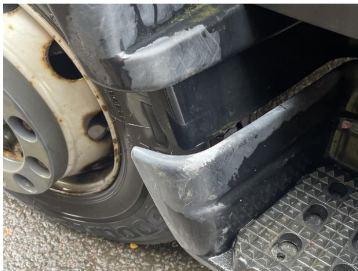
2: Door Moulding osf Scuffed (Unpainted) Over 100mm